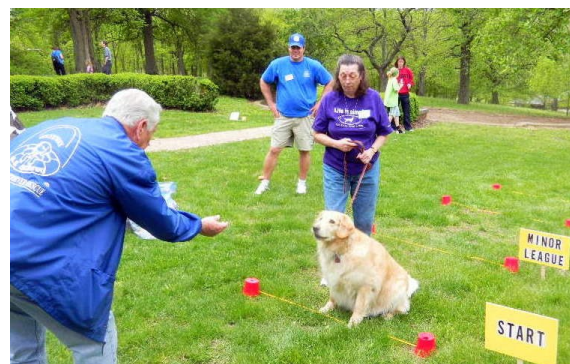
The hot dog toss requires extreme concentration.

If nothing else works, your dog should not have to suffer. Seek out the advice of your veterinarian, and, if you've gone as far as you can with him/her, consider someone with unique training in these areas — perhaps a board-certified veterinary behaviorist.