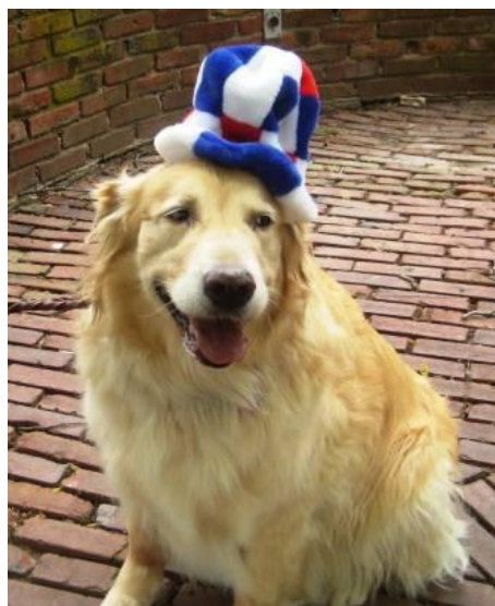
Another Doggie Dress Up Contestant at our Annual GGRR Reunion Picnic. At least he has a smile on his face!

A Big Thank You to all of our Members that helped out at our Reunion Picnic on May 1st!