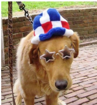
One of the best dress-up contestants from our picnic.