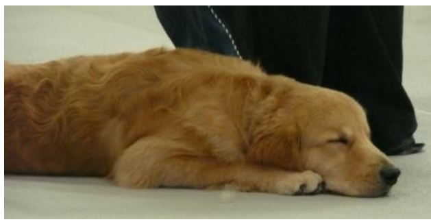
One of the Golden at the Golden Specialty catches a few minutes of shut-eye before competition.